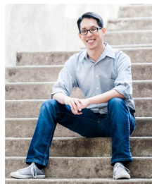
Gene Luen Yang American Born Chinese