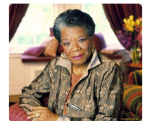
Maya Angelou I Know Why the Caged Bird Sings