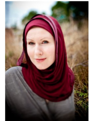
G. Willow Wilson Ms. Marvel