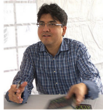
Sherman Alexie The Absolutely True Diary of a Part-Time Indian

Why should you use the smallest portion of quoted passage?