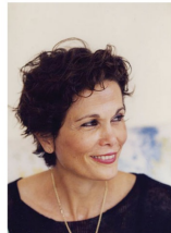
Julia Alvarez In the Time of the Butterflies